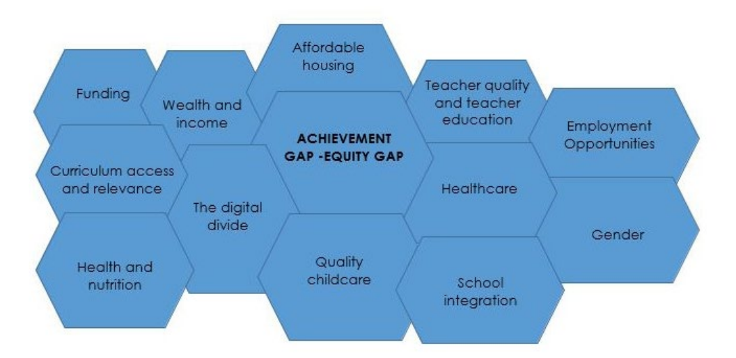
Figure 1: Milner's (2010) figure depicting the achievement gap and the equity gap ((Wood etal. (2011:59))

Wood et al. (2011:59) make the point that "the education sector alone cannot solve all the problems of society", and that "equity issues [in education] need to be addressed in different areas of social and economic policy in order to have sustained impact" [the author's own insertion]. They use a figure developed from Milner's (2010) work to give an indication of the magnitude of the factors that have to be taken into consideration when strategies are designed to achieve equity in education (see figure 1).